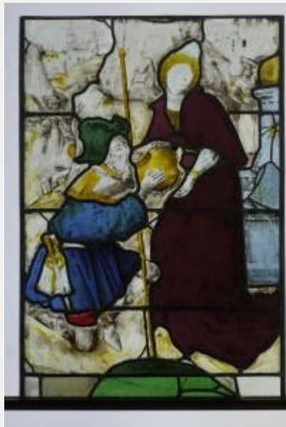
Fig. 2. Rebecca and Isaac at the Well after conservation. ©Jonathan and Ruth Cooke

[Fig. 1]. In their report The conservators described the state of the glass and its historical importance and made detailed proposals for its conservation. The dramatic improvement in the condition of the panel following conservation can be seen in Fig. 2.