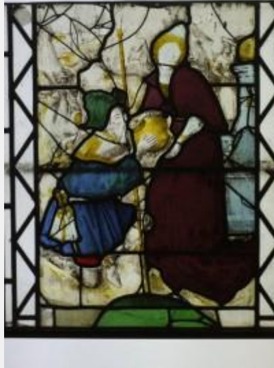
Fig. 1. Rebecca and Isaac at the Well before conservation.