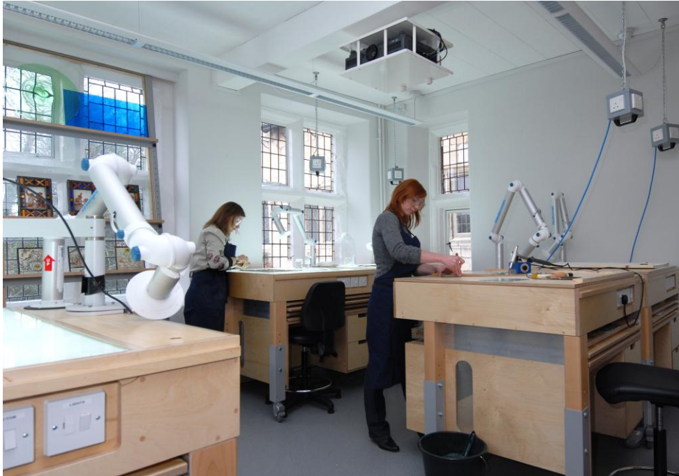
Students at the stained glass conservation studio at The King's Manor, The University of York

In 2009 the Glaziers' Trust awarded its first bursary of £5,000 to the MA Stained Glass Conservation and Heritage Management course at the University of York. This two-year innovative course – the only one of its kind in the English-speaking world – offers training in stained glass conservation workshops, heritage management, arts administration, architectural offices, and the administration of historic buildings and museums and is a preparation for higher research degrees. The recipient of this bursary from the Glaziers' Trust achieved an MA with distinction.